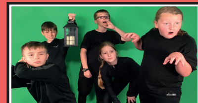
Year group performances