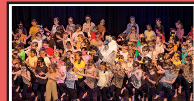
Performing Arts Soire - Y2-6