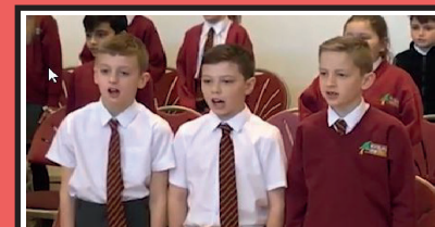
Singing Assemblies - All Year