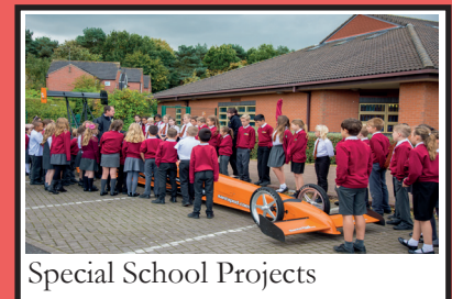
Special School Projects