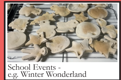
School Events - e.g. Winter Wonderland