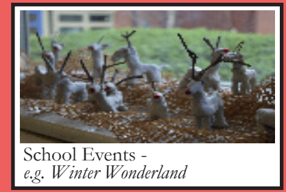
School Events - e.g. Winter Wonderland